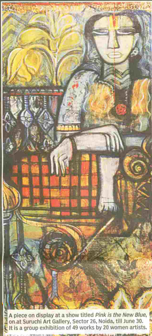
A piece on display at a show titled Pink is the New Blue , on at Suruchi Art Gallery, Sector 26, Noida, till June 30. It is a group exhibition of 49 works by 20 women artists.