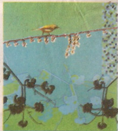
Before Flying Med by Mousumi Biswas

understood, however, as to why the 'star' must sport such a derisive, horsy countenance.