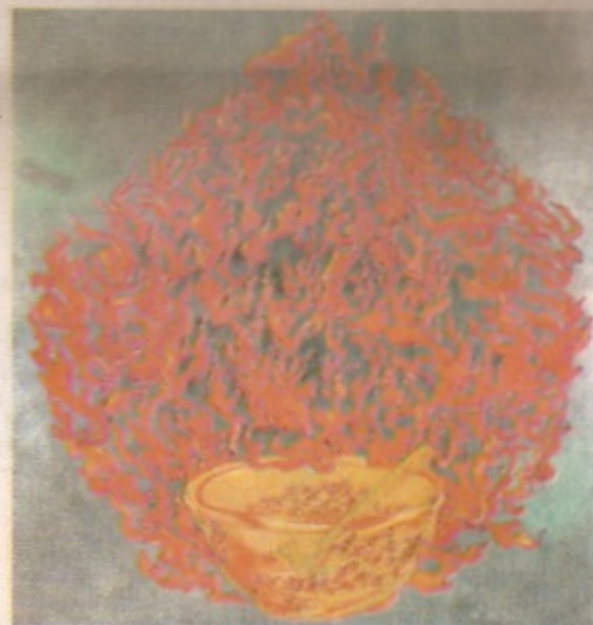
Pratik Sagar's Faith Med

By contrast Srikant Poddar's 'Optimism' carries a very homespun character, depicting a star and a young street boy's dream of becoming one. It is not